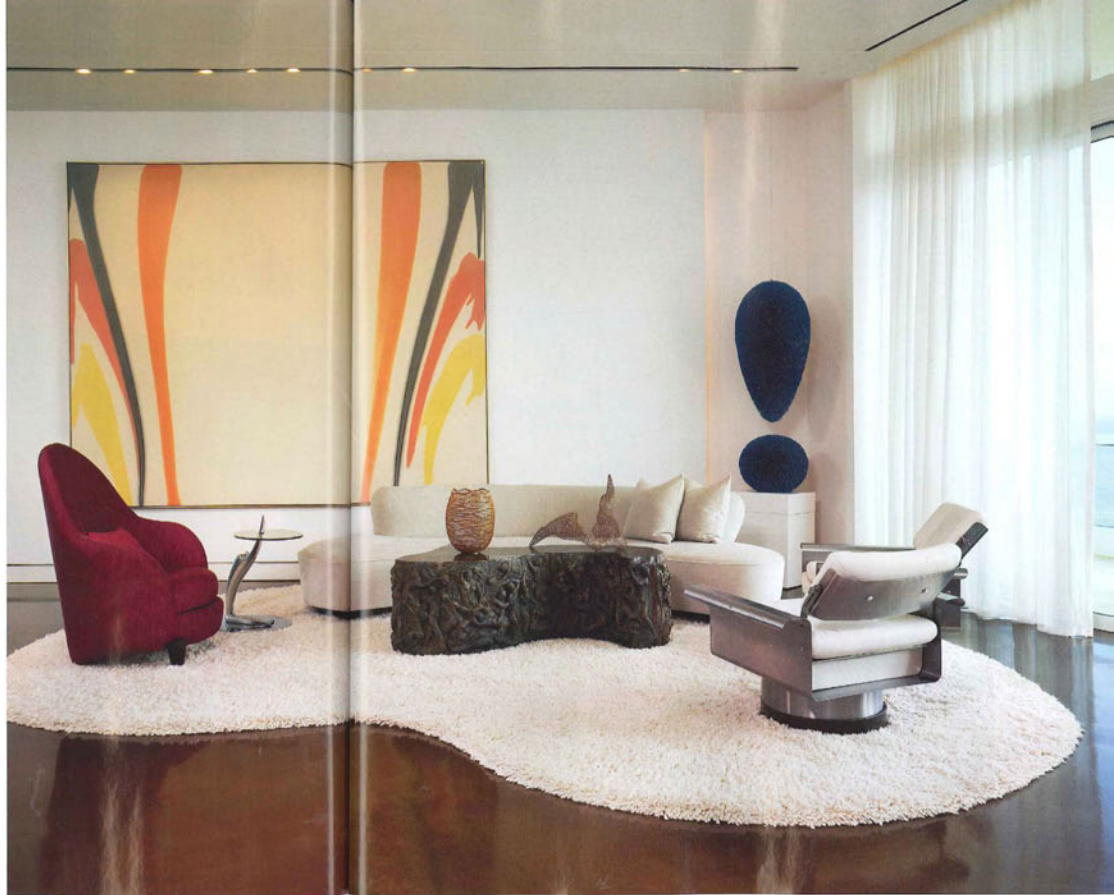
Male custom designed the living room's shag area rug to fit the clean lines of Vladimir Kagan's 'Cloud' sofa in Great Plains chenille. Artistic elements include Morris Louis' signature painting, 'Delta Pi,' Philip LaVerne's cast-bronze cocktail table and Richard Artschwager's 'Exclamation Point.'