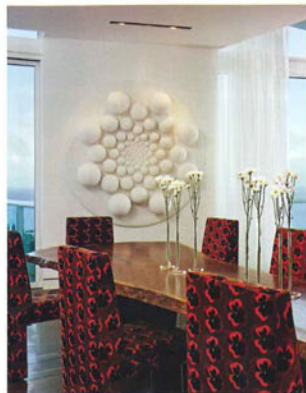
ABOVE: Miami artist Bhakti Baxter's mixed-media work made of foam, plaster and paint, entitled "An Intelligible Sphere," adds an element of surprise to the dining room.

After maintaining a townhouse as their vacation retreat in the same Aventura, Fla., development, the couple purchased this spacious residence atop a luxury high-rise on the Intracoastal Waterway as their full-time home. The owners called upon contractor Greg Milopoulos to lead construction efforts of this 7,000-square-foot apartment with an additional 7,000 square feet of terrace space and, upon a friend's referral,